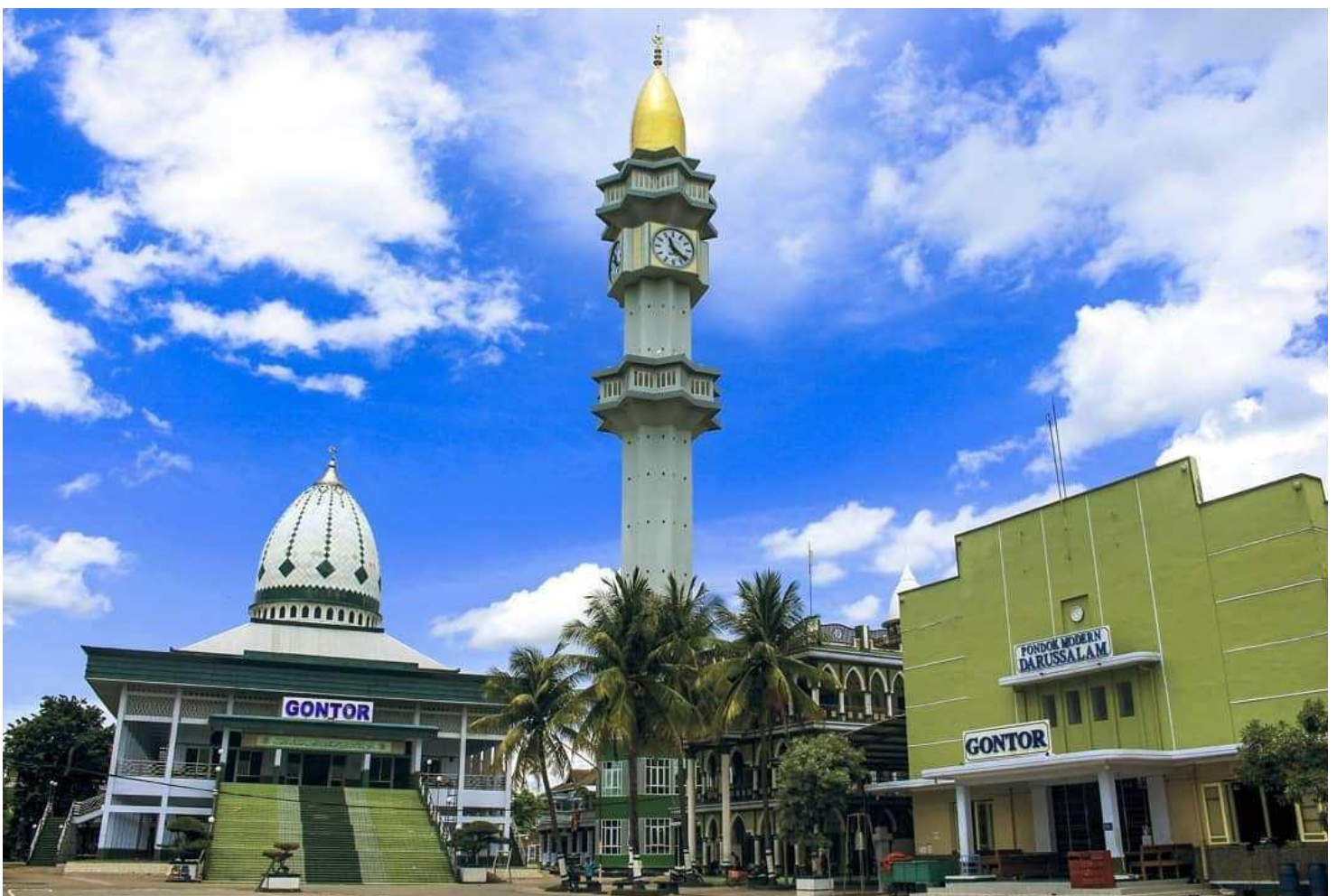
Menara Masjid Jami Gontor dibangun dengan ketinggian 85 meter, dilengkapi dengan 4 jam analog ukuran besar dengan diameter jam 4 meter di empat sisi arah mata angin.

Peletakan batu pertama dilaksanakan pada tahun 2016 oleh Bapak Presiden RI dan Pimpinan Pondok, peresmian dilakukan oleh Bapak Jusuf Kala, tahun 2018